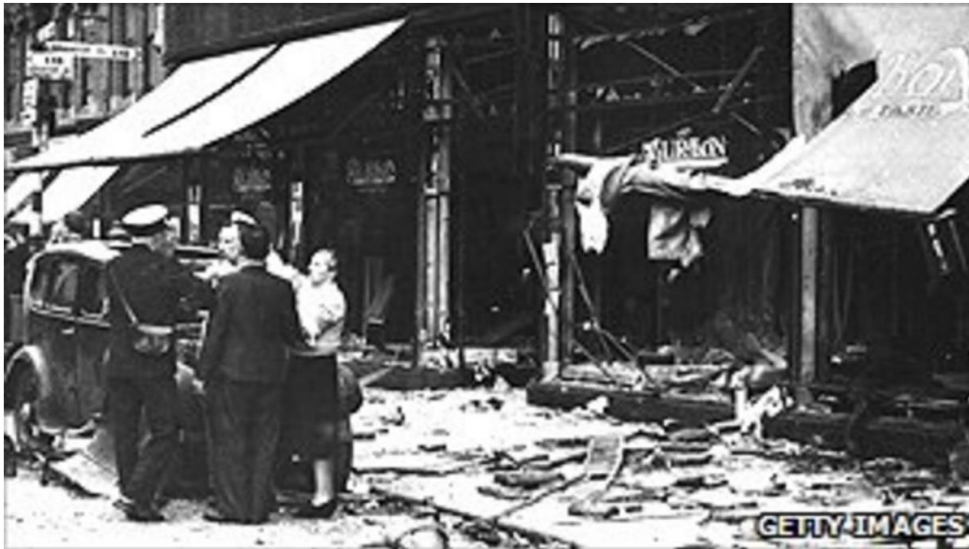
Broadgate in Coventry was bombed by the IRA in August 1939