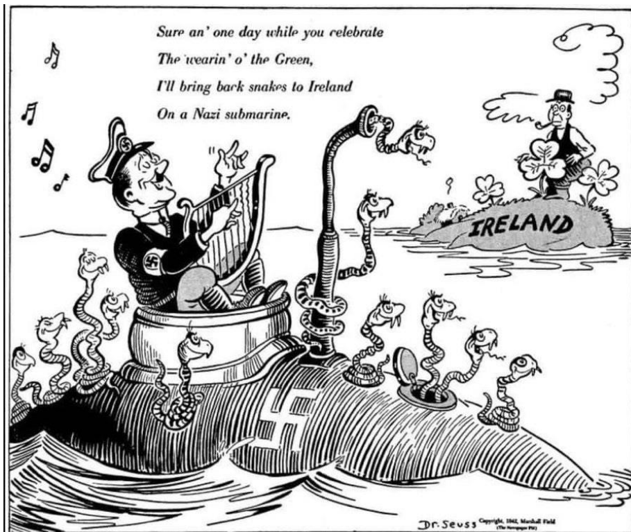
A satirical cartoon by Dr. Seuss about Irish neutrality. Published in the New York newspaper PM , 18 March 1942

https://winstonchurchill.org/publications/finest-hour/finest-hour-145/churchill-proceedings-that-neutral-island/