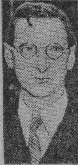
Eamon de Valera.

Revolutionary in scope and hailed as a personal triumph for De Valera, the document declares the “inalienable” right of the Irish nation “to choose its own form of government, to determine relations with other nations, and to develop its life, political, economic, and cultural, in accordance with its own genius and traditions.” It provides for the election of a president by direct vote.