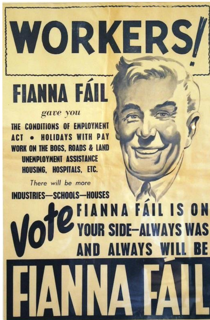
Fianna Fáil Election Poster, 1948