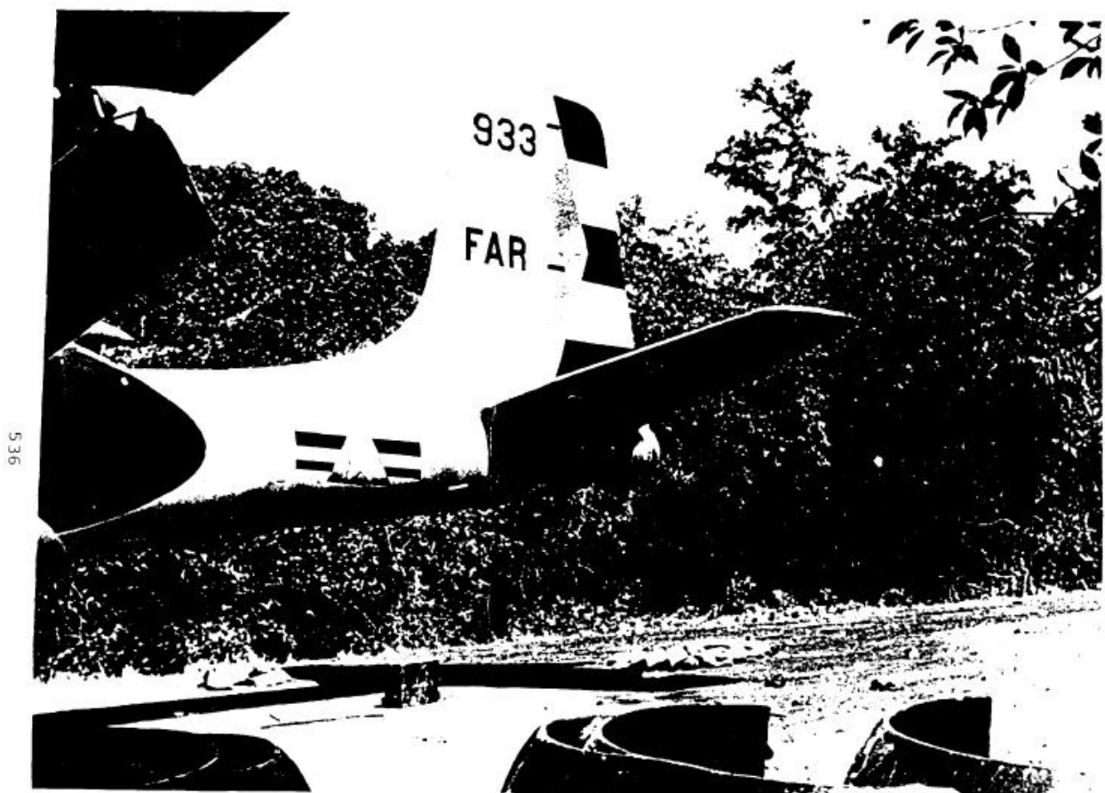
FIGURE 30 PUERTO CABEZAS. B-26. TAIL ASSEMBLY DETAIL. CUBAN INSIGNIA, FAR, AND TAIL NUMBERS IDENTICAL TO CASTRO'S B-26's.

Source 11: US Douglas A-26 Invader "B-26" bomber aircraft disguised as a Cuban model in preparation for the Bay of Pigs Invasion